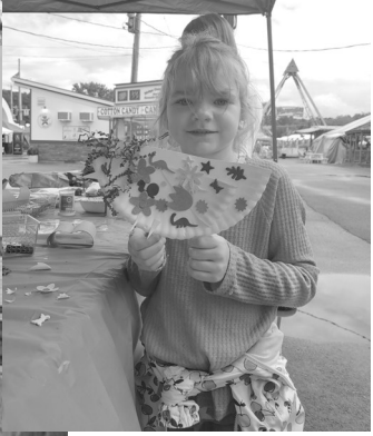
Kids Day FUN!