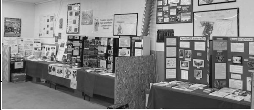
Fair Booth! We are located in the Horticulture Building!

If you would like to be added to our mailing list please contact us at (518) 651-2097