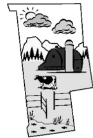
"Providing Today Protecting Tomorrow"

For information, question and concerns on the 2018 tree sale, please feel free to call us at 518-651-2097